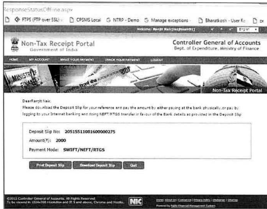
Figure 4: Download Deposit Slip page