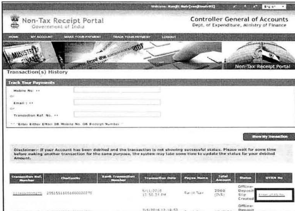
Figure 6: Track your payment page

User will have to login at NTRP>>Track your transaction page and enter the UTR No. for each such transaction done at NTRP.