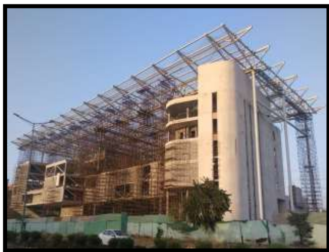
REC project work in progress of TCIL