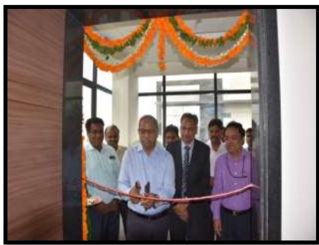
Launch of Southern Office by CMD TCIL